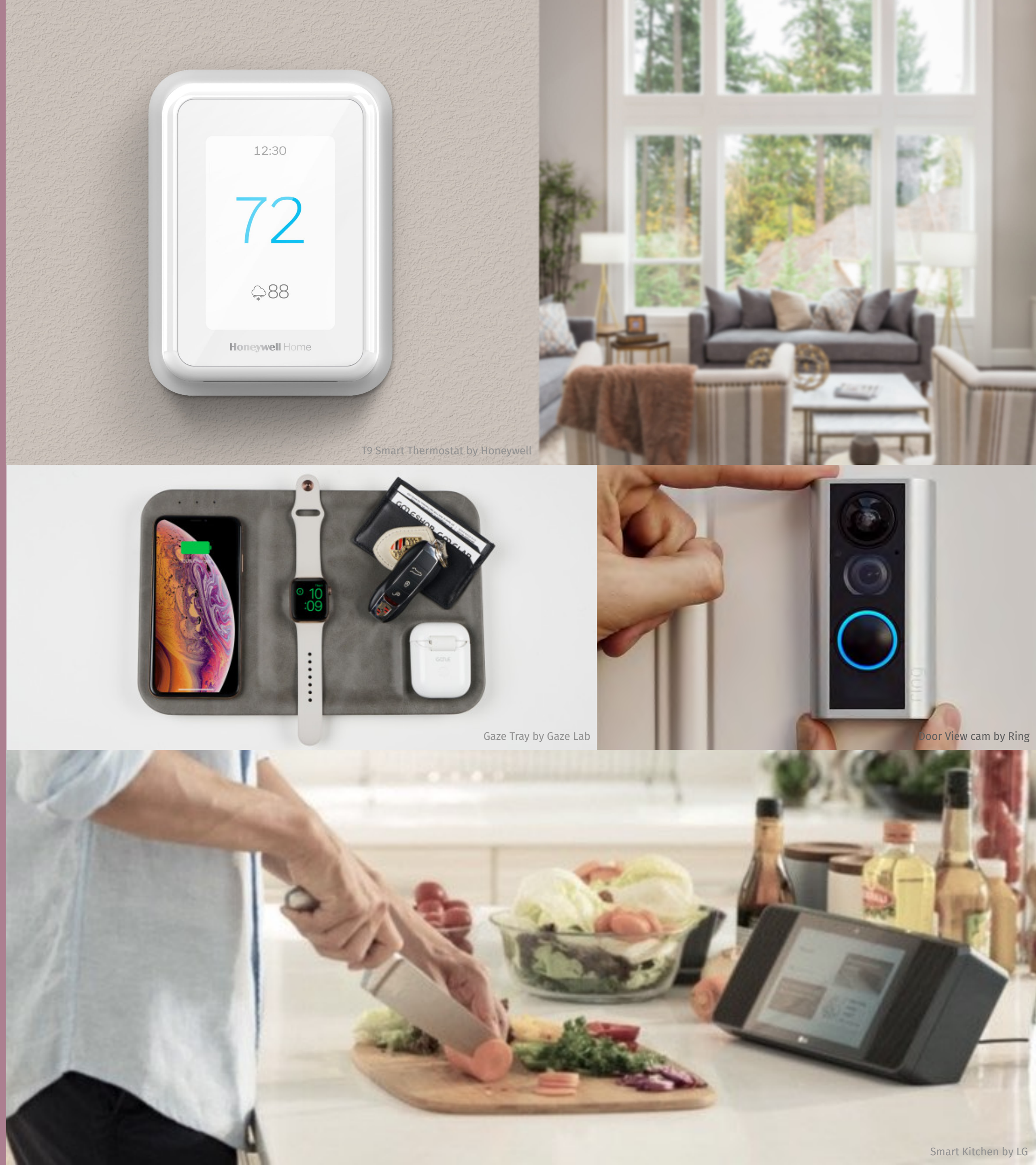
T9 Smart Thermostat by Honeywell

Also worth mentioning are the projected touch screen interphases. The technology is only in its debuts, however it has been a topic of discussion over the past recent years as it represents a whole new world of opportunities thanks to its interactive and much bigger interface. A few of the A brands have shown their first models and we wouldn't be surprised to see more of these already this year.