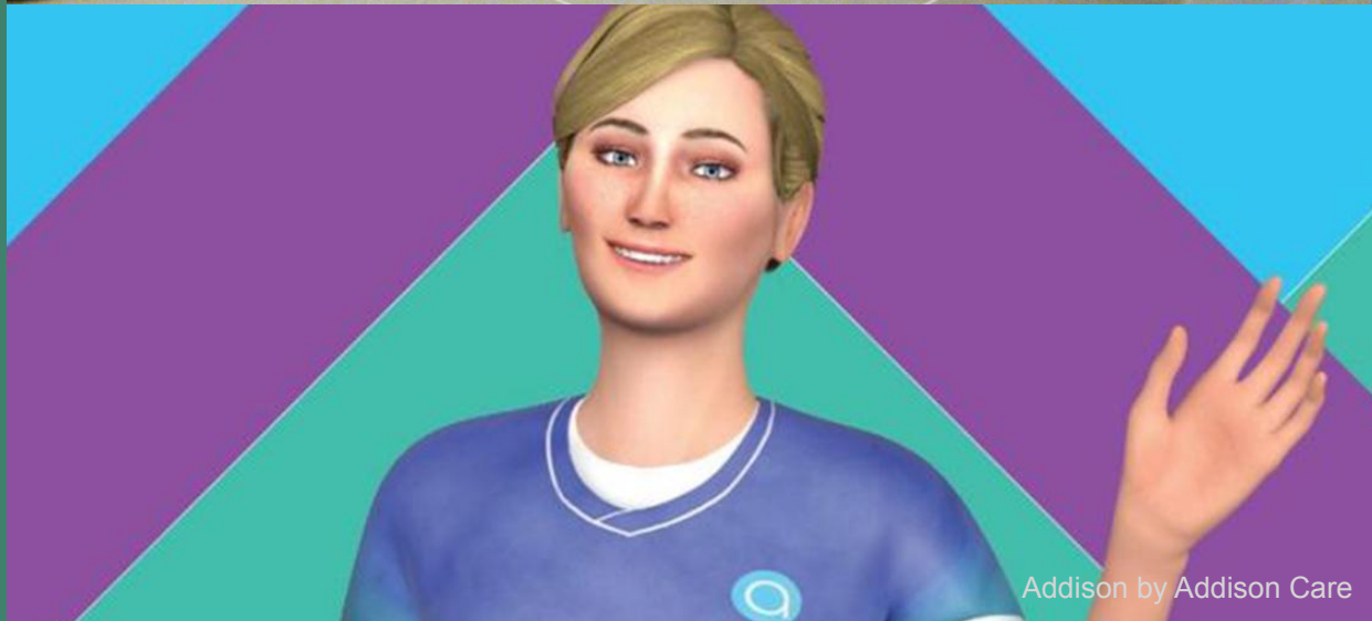
Addison by Addison Care