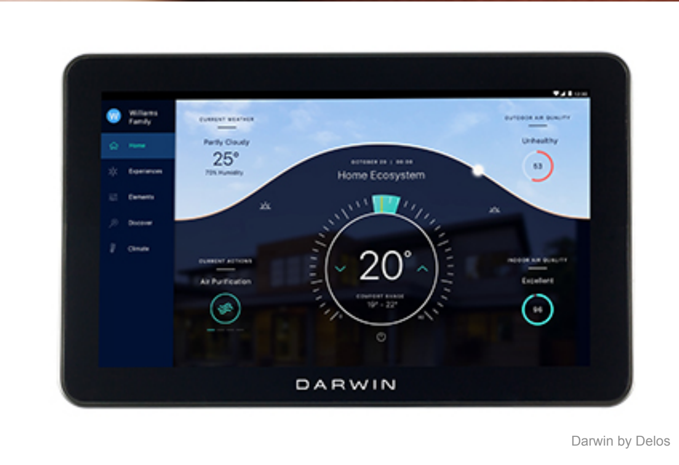
Darwin by Delos