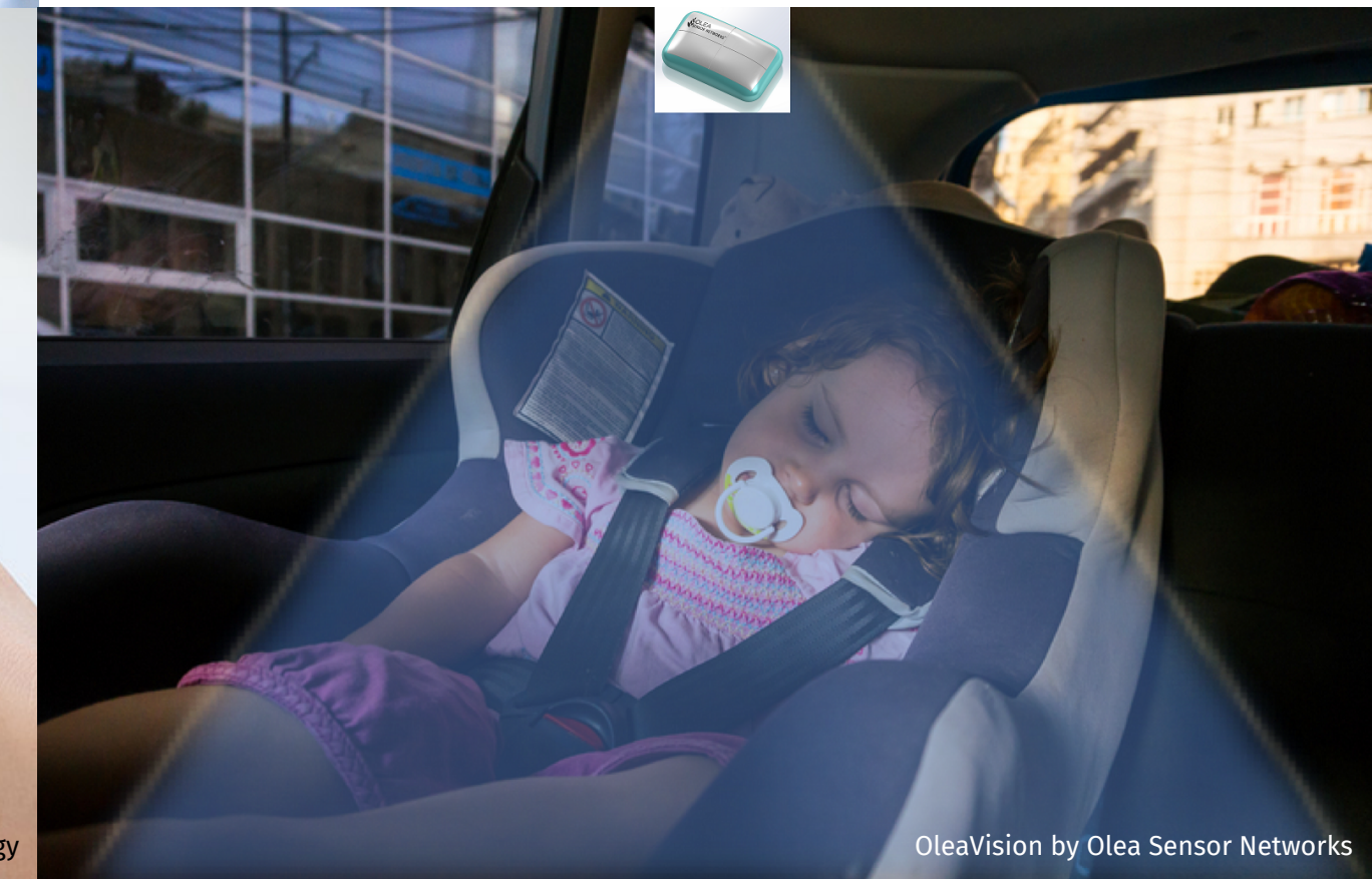
OleaVision by Olea Sensor Networks