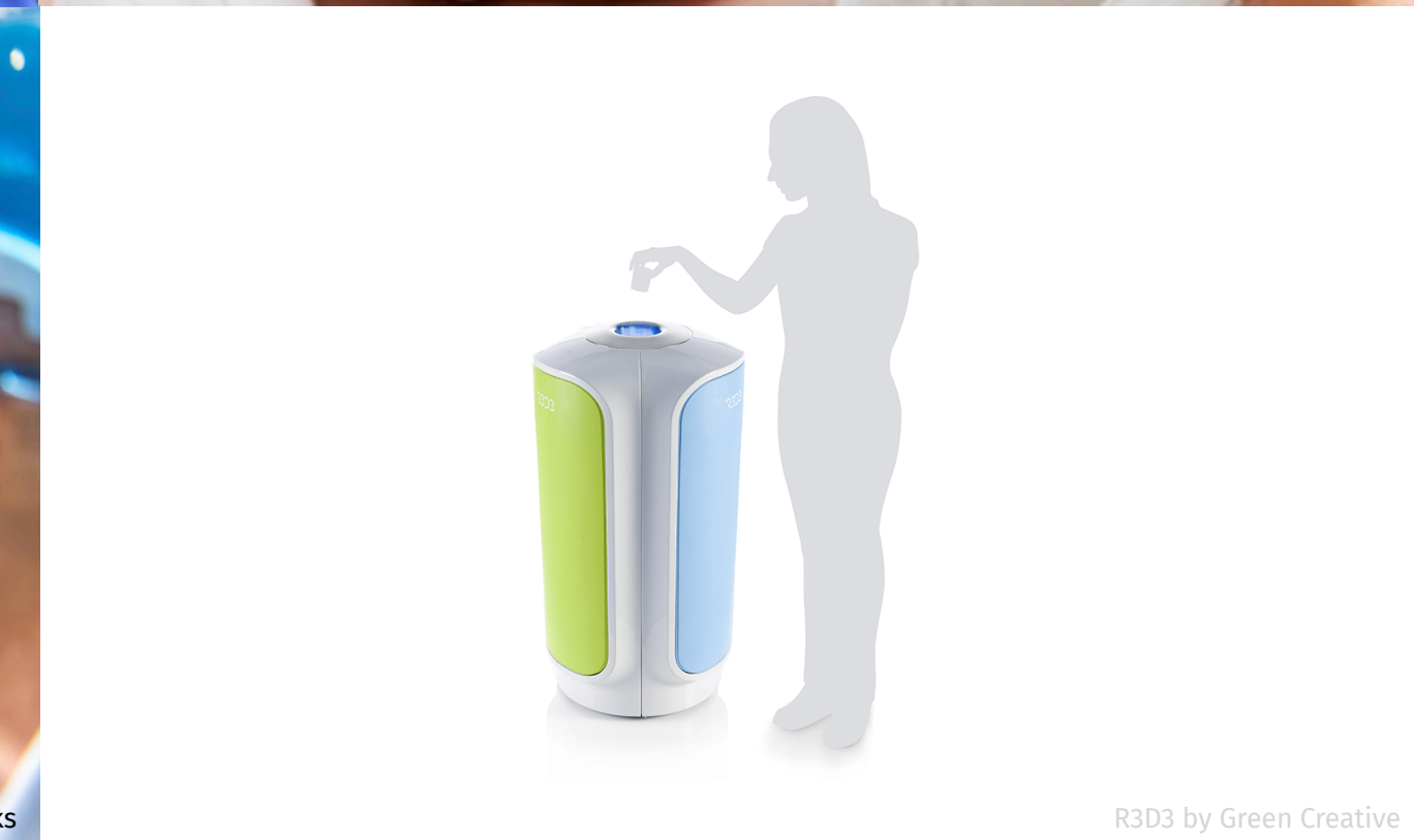
R3D3 by Green Creative