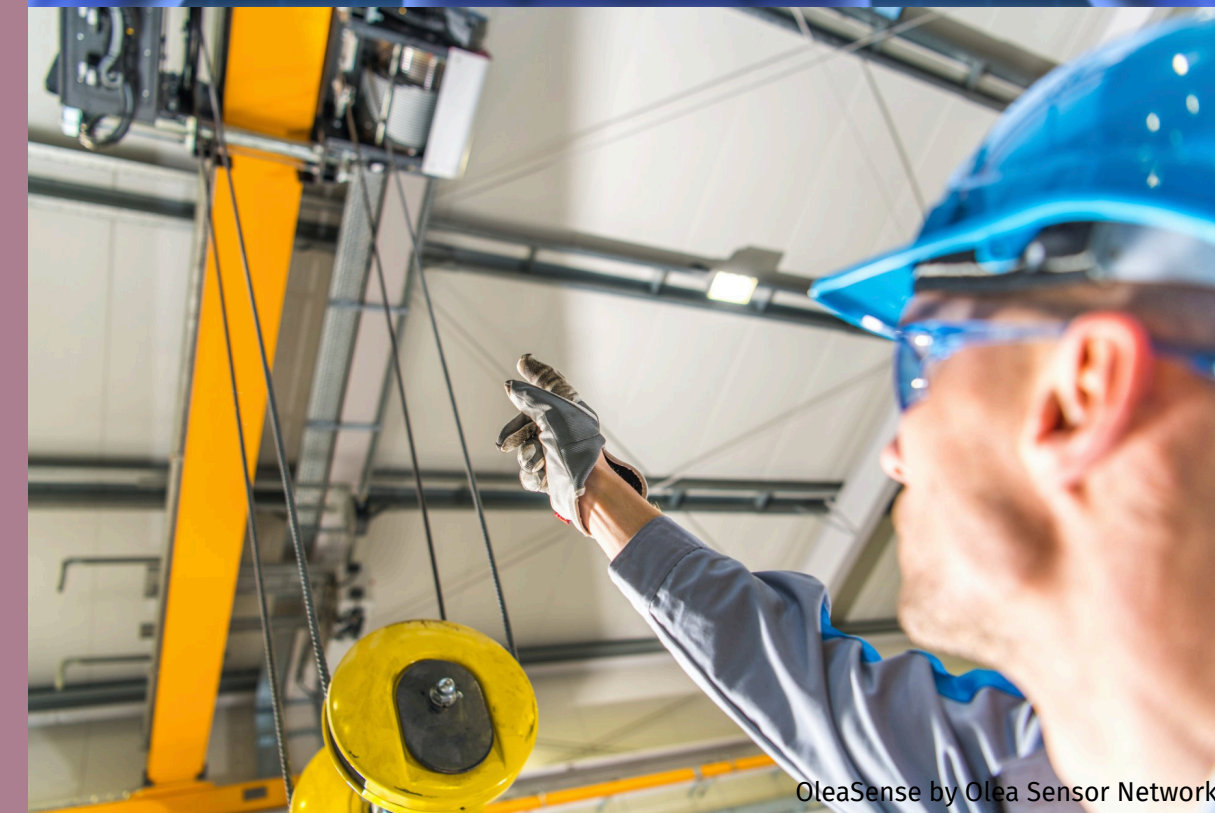
OleaSense by Olea Sensor Networks