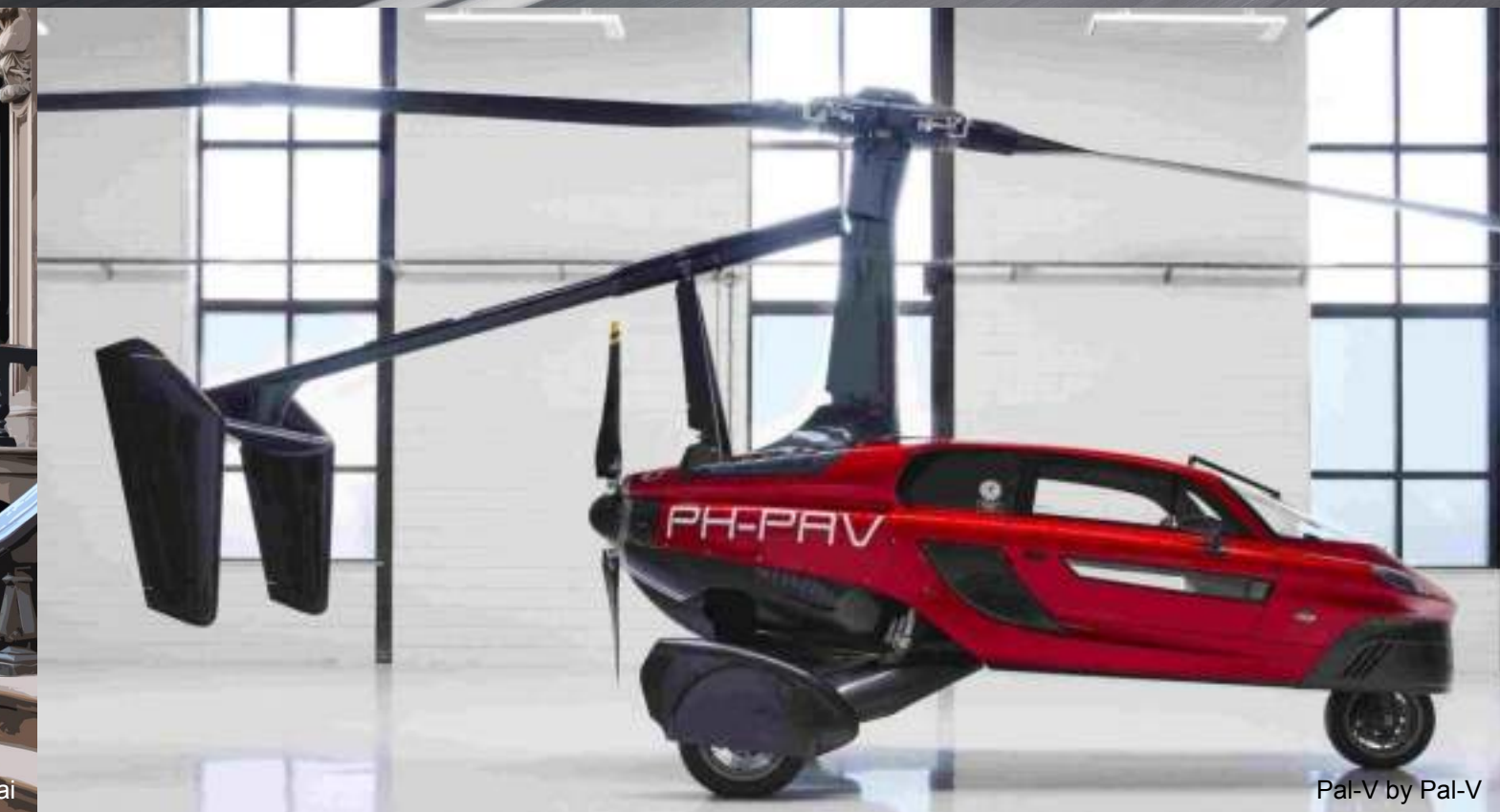
Pal-V by Pal-V