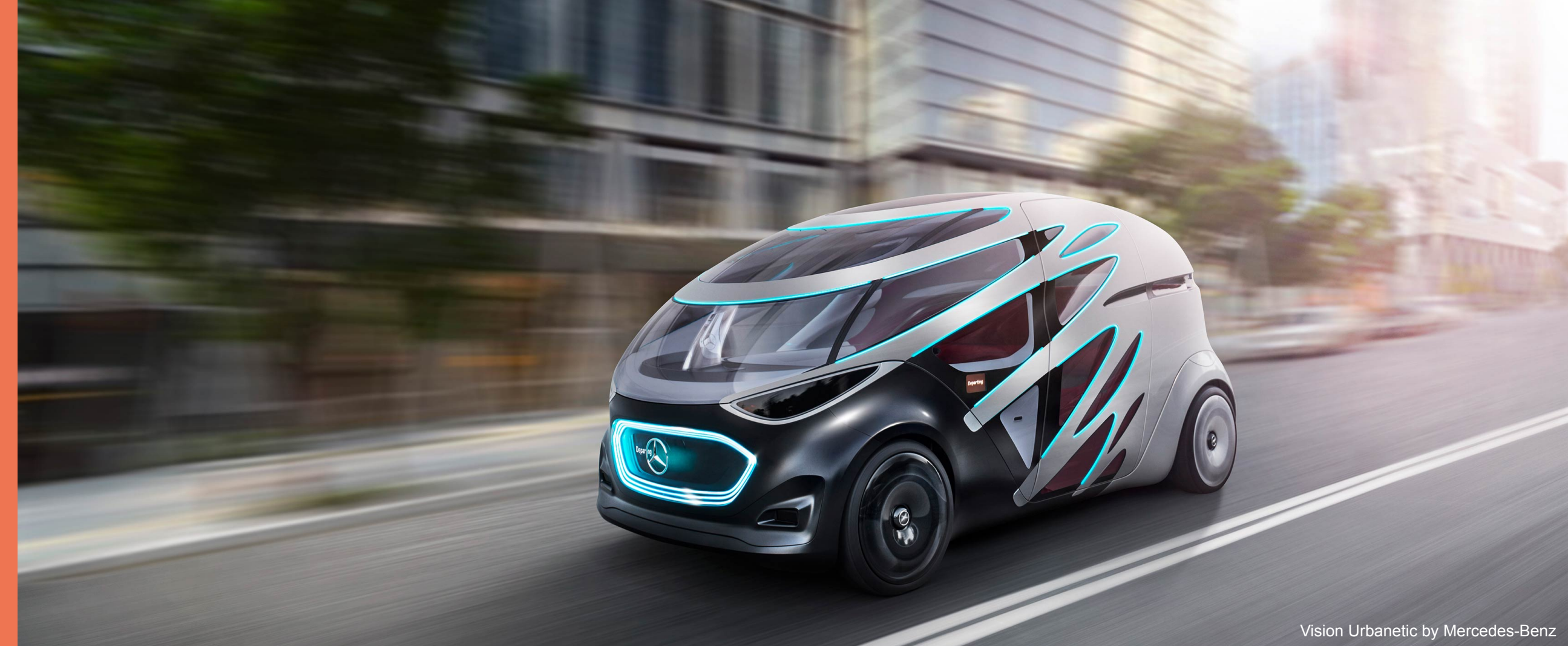
Vision Urbanetic by Mercedes-Benz

Besides vehicles innovation, urban infrastructure will also be key in improving our mobility. Continental presented its plans for a smart city where connectivity will improve traffic flows and reduce accidents and pollution. A compelling example of what the company introduced is its comprehensive Intelligent Intersection Pilot , which through the means of AR, will be able to warn drivers about pedestrians or cyclists, control signal changes, streamline traffic and emissions. Continental's intelligent Street Lamp is also quite interesting as it is not only meant to monitor lighting, but also to analyse the environment in order to retrieve useful data for road (and life-quality) optimisation.