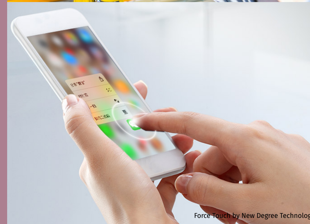
Force Touch by New Degree Technology