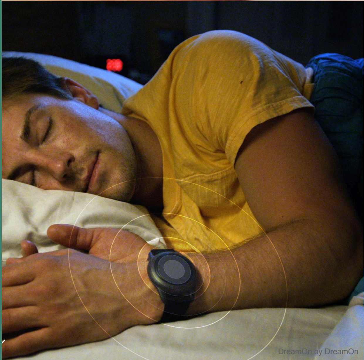
DreamOn by DreamOn