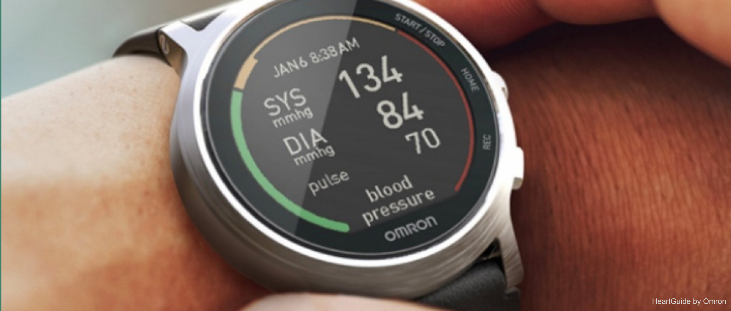
HeartGuide by Omron

As consumers get more and more aware and alert about health and wellness, and as the population grows older, innovations in this category are crucial.