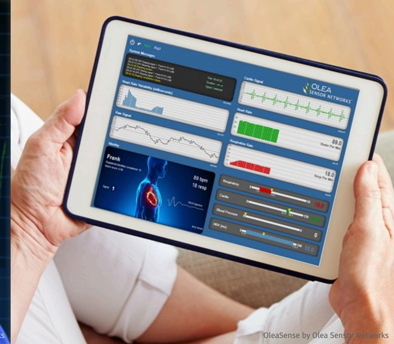
OleaSense by Olea Sensor Networks