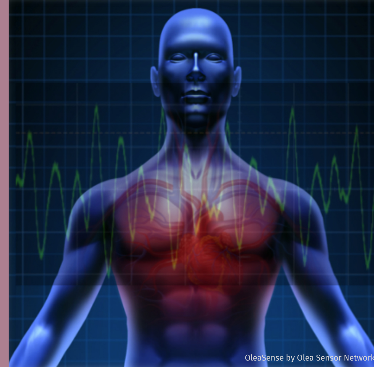
OleaSense by Olea Sensor Networks

There are many other products that target very different types of goals. For instance, Green Creative's R3D3 , a smart sustainable bin, which recognises, sorts and compacts cans, cups and plastic bottles. What we find particularly interesting here is how the product also changes consumers' view and habits towards recycling through its specs: capacity of 10 bins, odour free, user friendly, time saving (waste collection upon request) and, of course, connected (activity tracked via website).