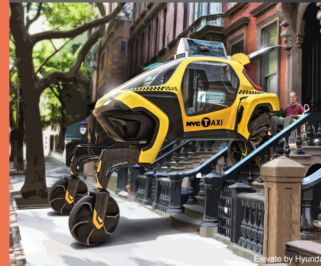
Elevate by Hyundai