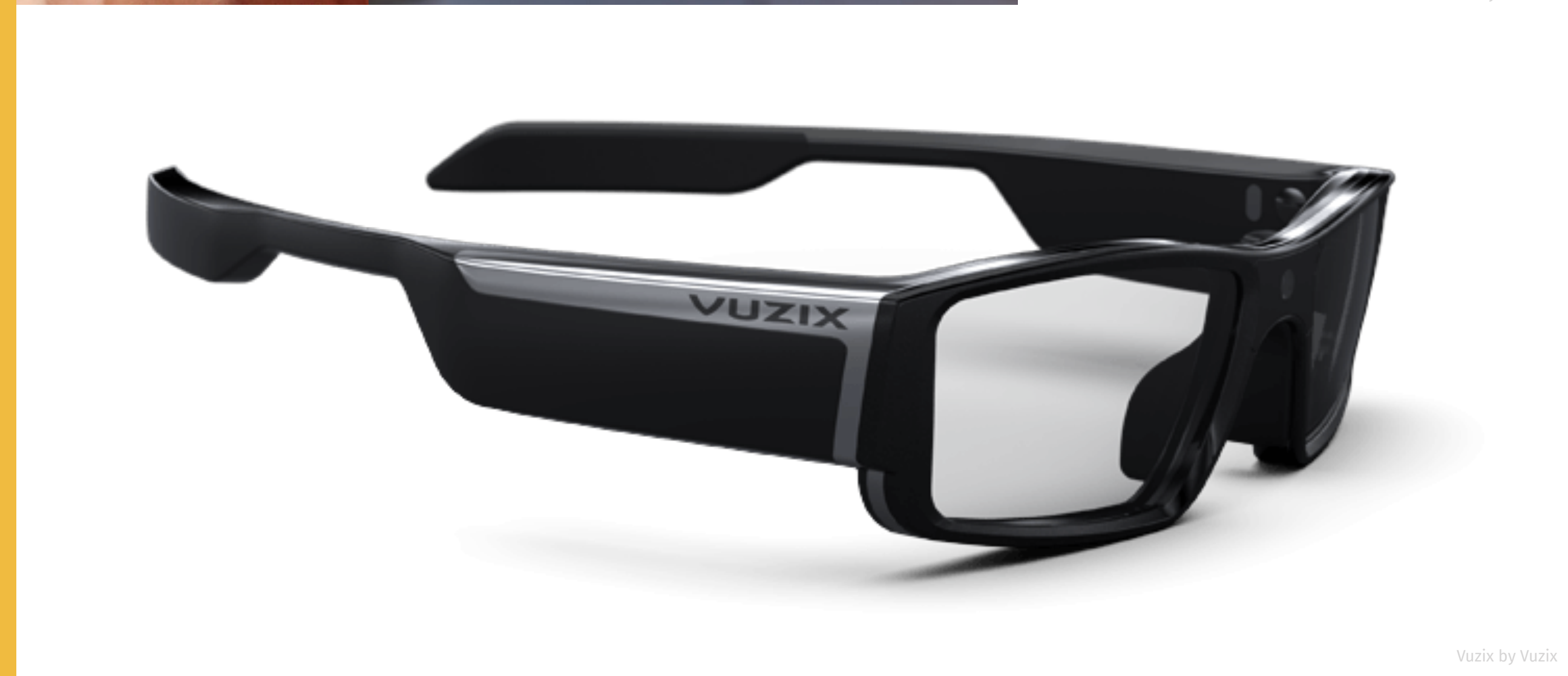
Vuzix by Vuzix