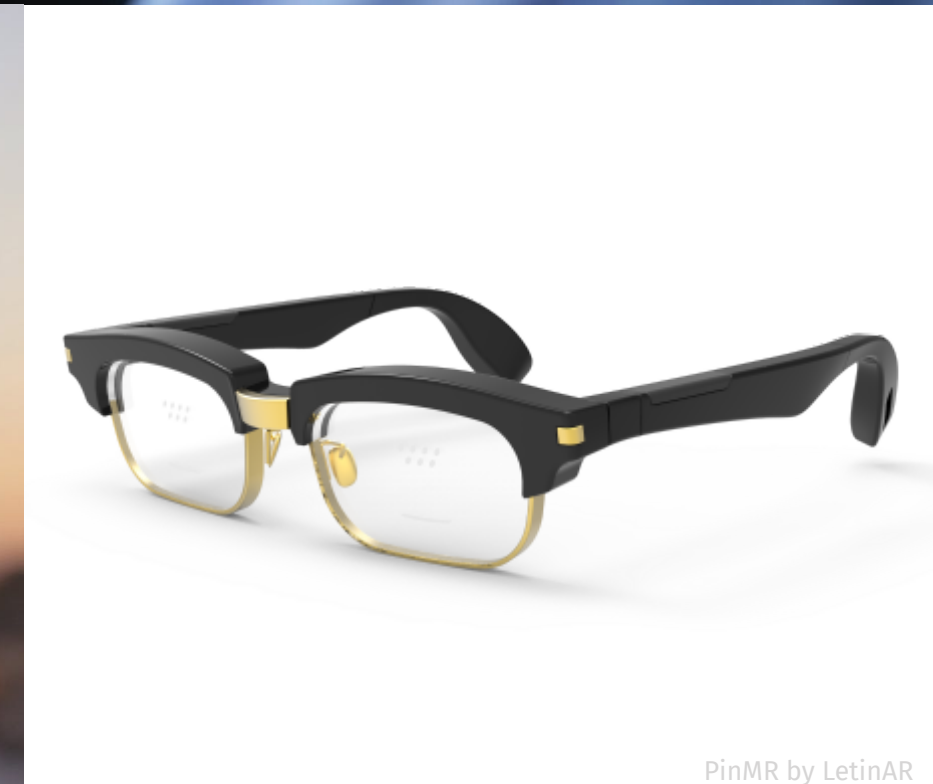
PinMR by LetinAR